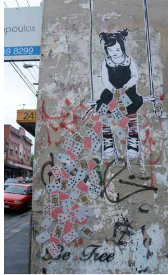
Above left: Icy and Sot, Tabriz, Iran (2011); above right and below: Be Free, Melbourne, Australia (2011); right: Be Free, abandoned house, Melbourne, Australia (2012)