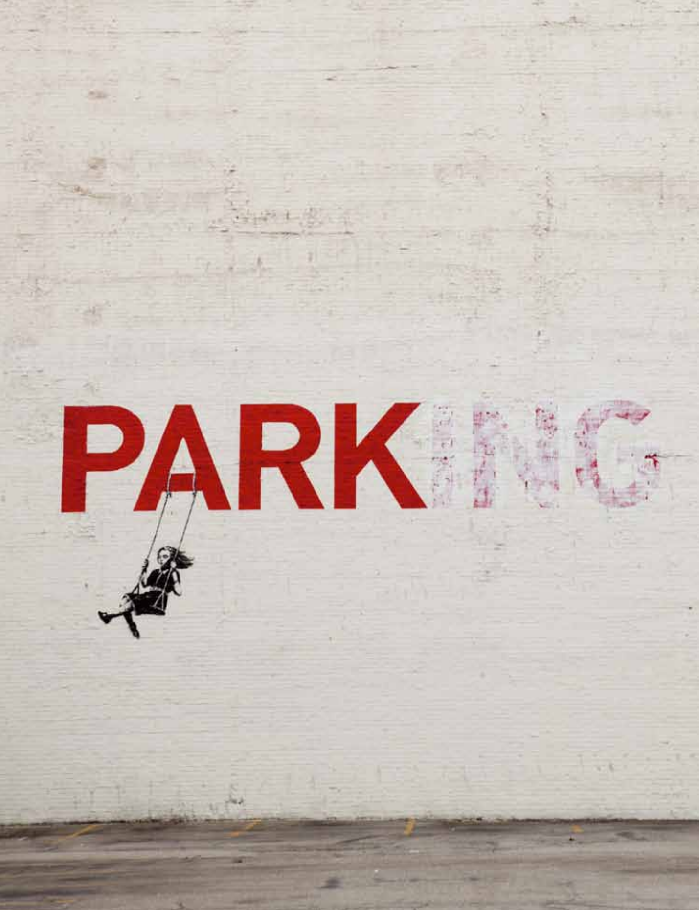
Left and top right: Banksy; bottom right: Camo, Pagewood, New South Wales, Australia (2012)