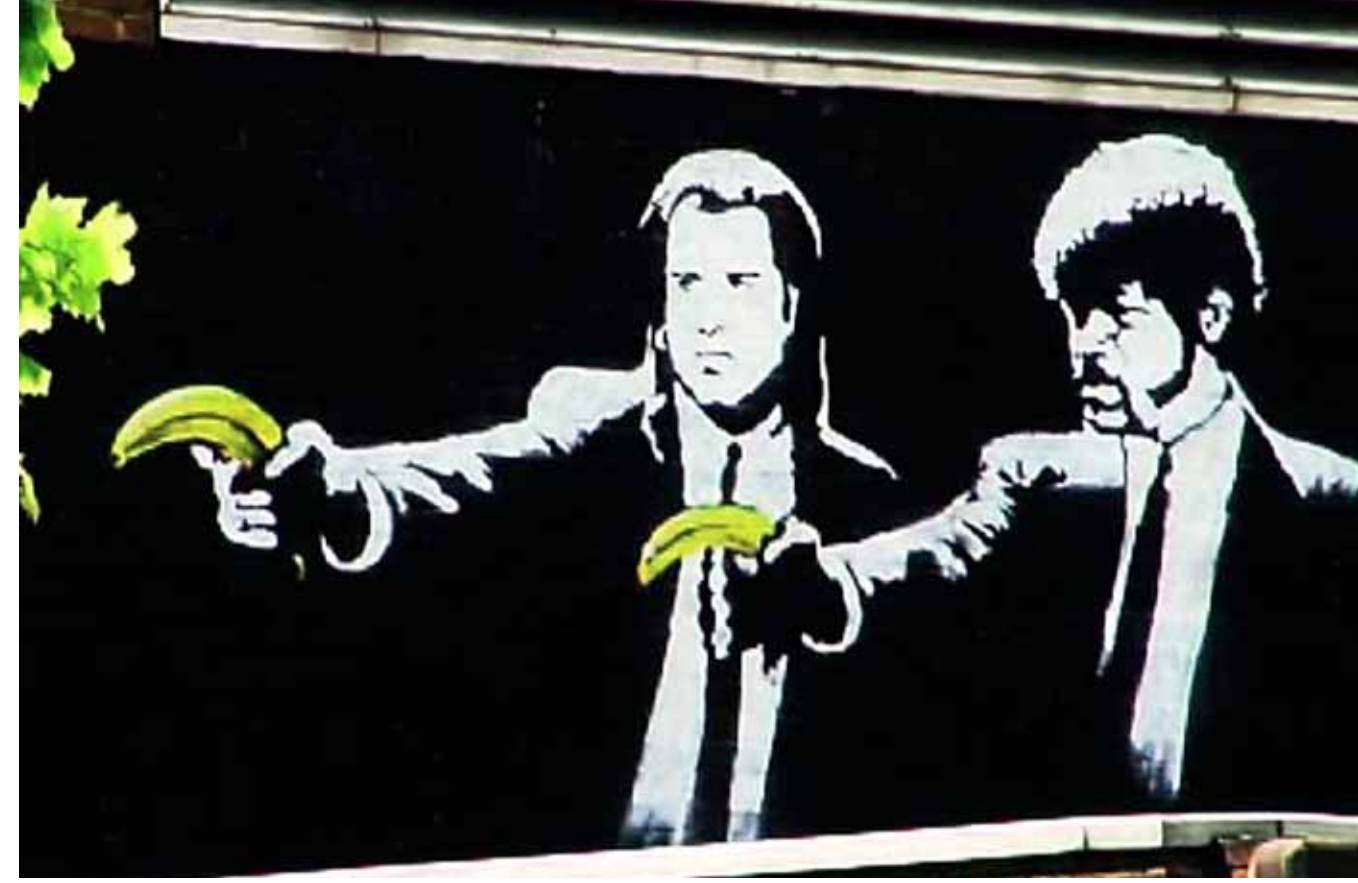
Left: Queen Elizabeth by Banksy; above: John Travolta and Samuel L. Jackson by Banksy; below left: David Duchovny by unknown artist, Boston, Massachusetts, USA (2012); below right: John Lennon by Icy and Sot, Tehran, Iran (2010)