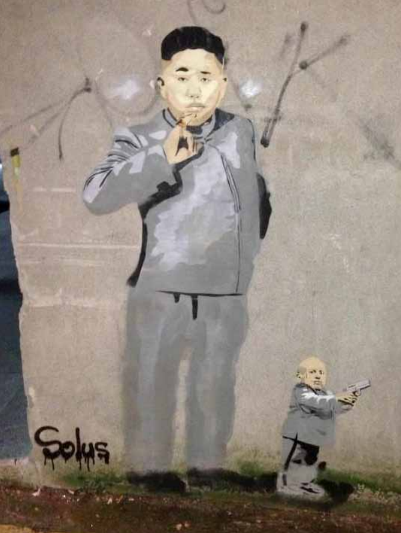
Left: Kim Jong-un as Dr Evil by Solus, Dublin, Ireland (2013); right: Rihanna by Zabou and Pegasus, London, England (2012)

'I like to create pieces that people can interpret freely, which would make them think, smile or any kind of reaction. I'm interested in attracting people's attention on a wall or a place they would never notice otherwise. Street art makes the daily and urban environment a bit more fun and interesting, and I'm definitely fighting for that cause.'